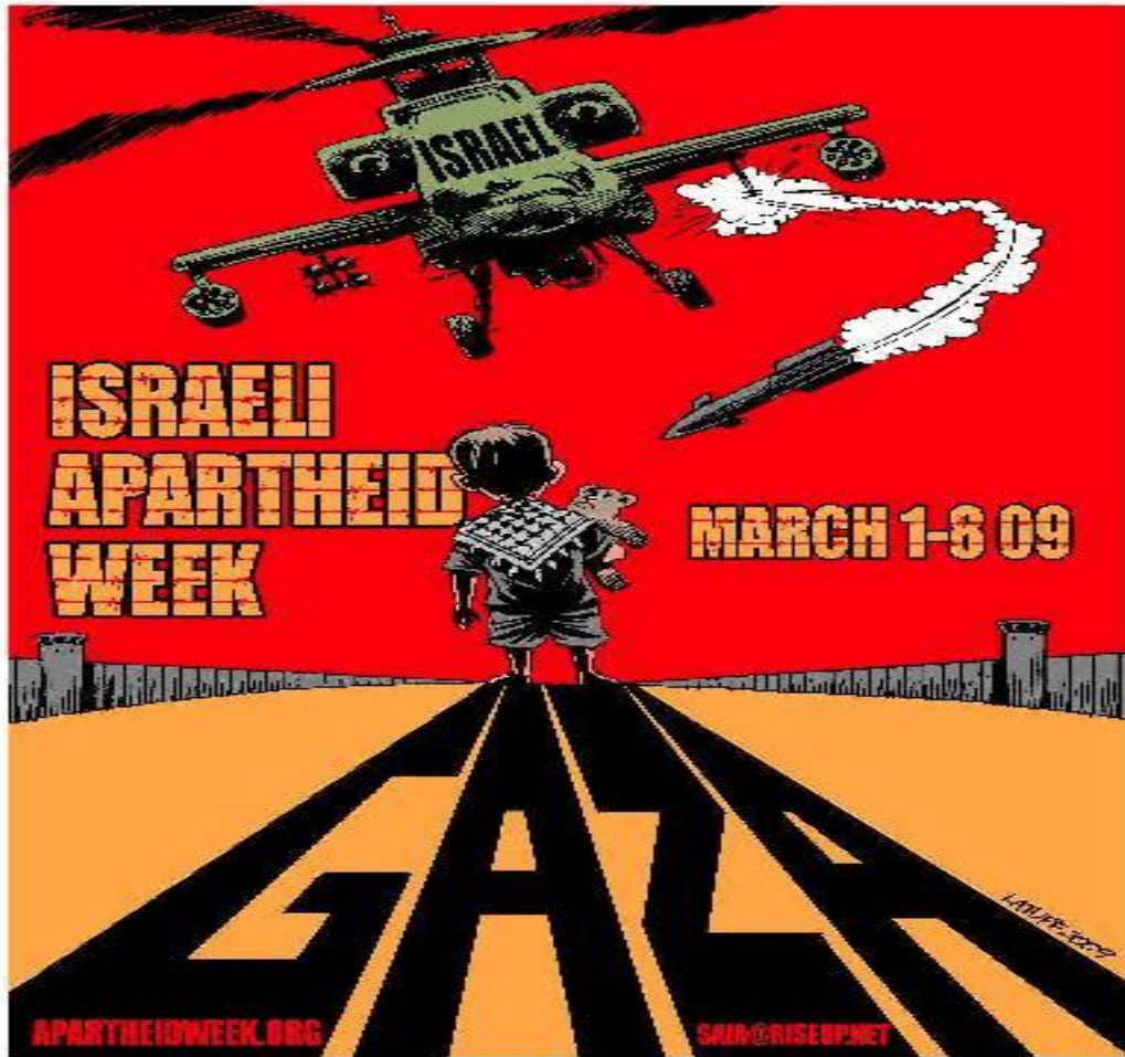
Appendix D: Poster put up on campuses to promote Israel Apartheid Week